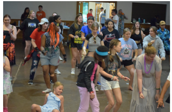
Summer 2024 Campers